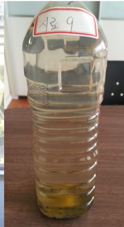
Phoslock + 70 days