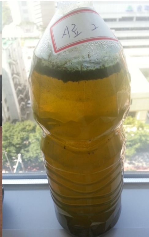
Phoslock + 30 days